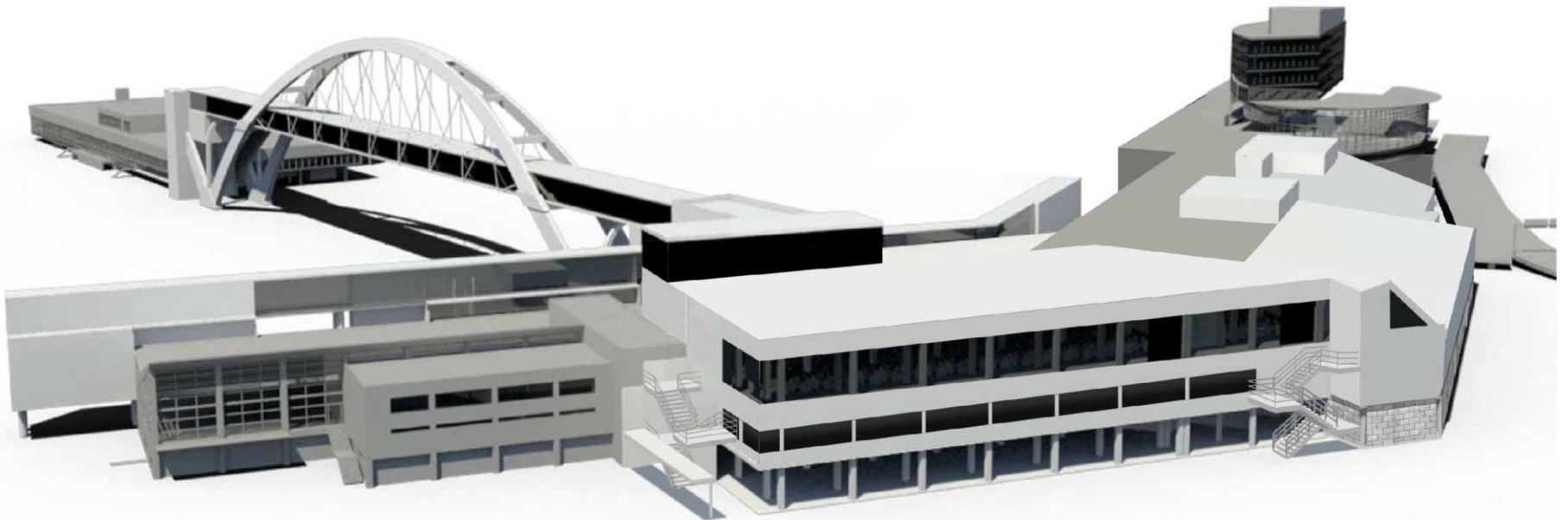
Current Program Concept